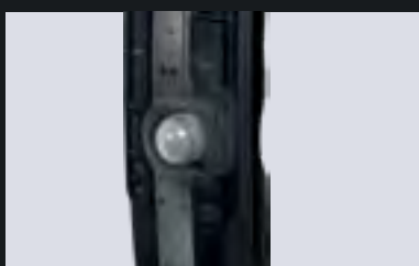
Trackball with smart Cursor Motion