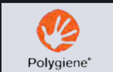
Antimicrobial Surface effectively protects against microbes