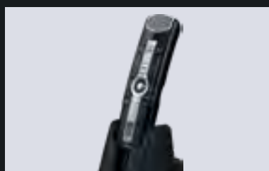
Microphone Stand with automatic Stand Detection allows for hands-free dictation