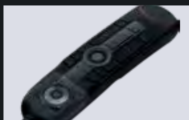
Closed Loudspeaker Chassis generates good sound quality